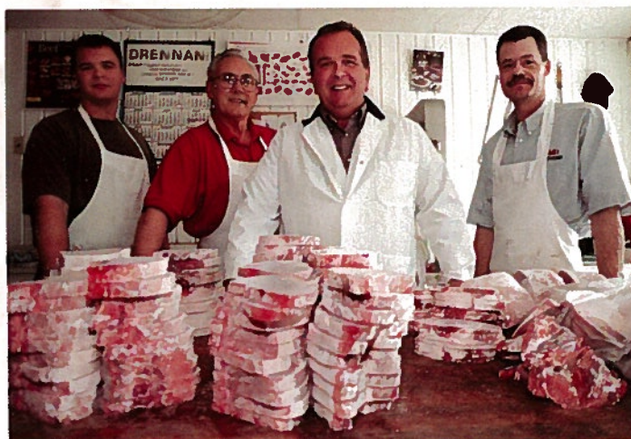
The Meat Men