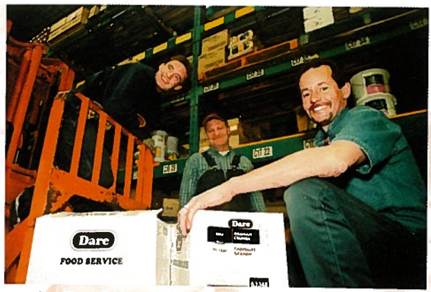
London Day Crew