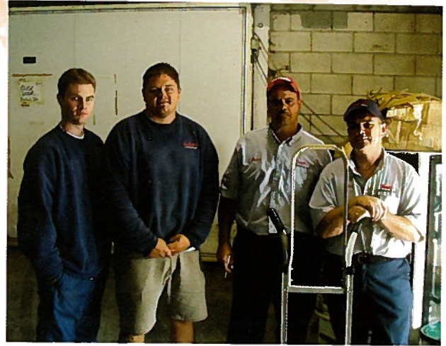
Dover Day Crew