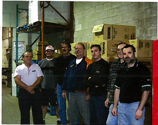
Windsor Night Hawks