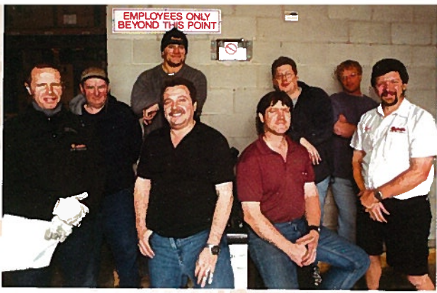
Windsor Day Crew